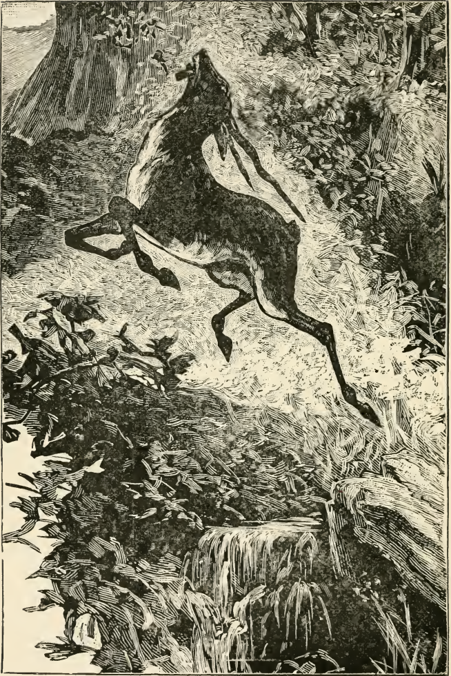
A BEAUTIFUL ANTELOPE BOUNDED FORTH - PAGE 181.